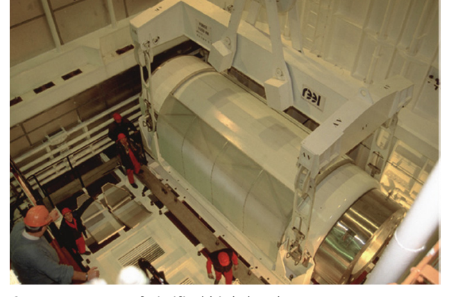
6 Sea transport of vitrified high-level waste