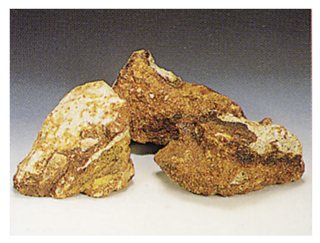
1 Uranium ore - raw material

A fuel pellet for typical light water reactors weighs about 10 grams and produces the equivalent energy of around 30 tonnes of coal or 20,000 litres of oil. The fuel pellets are stacked into zirconium alloy tubes that are then made up into fuel assemblies for transport from the fabrication plant to the reactor site. They are transported in specially designed fissile packages. The design and configuration of packages during transport ensures that a nuclear chain reaction cannot occur. However, the other types of packages are also used to the commensurate contents.