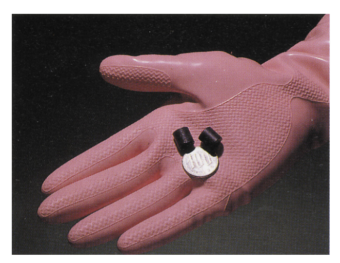
3 Fuel pellets